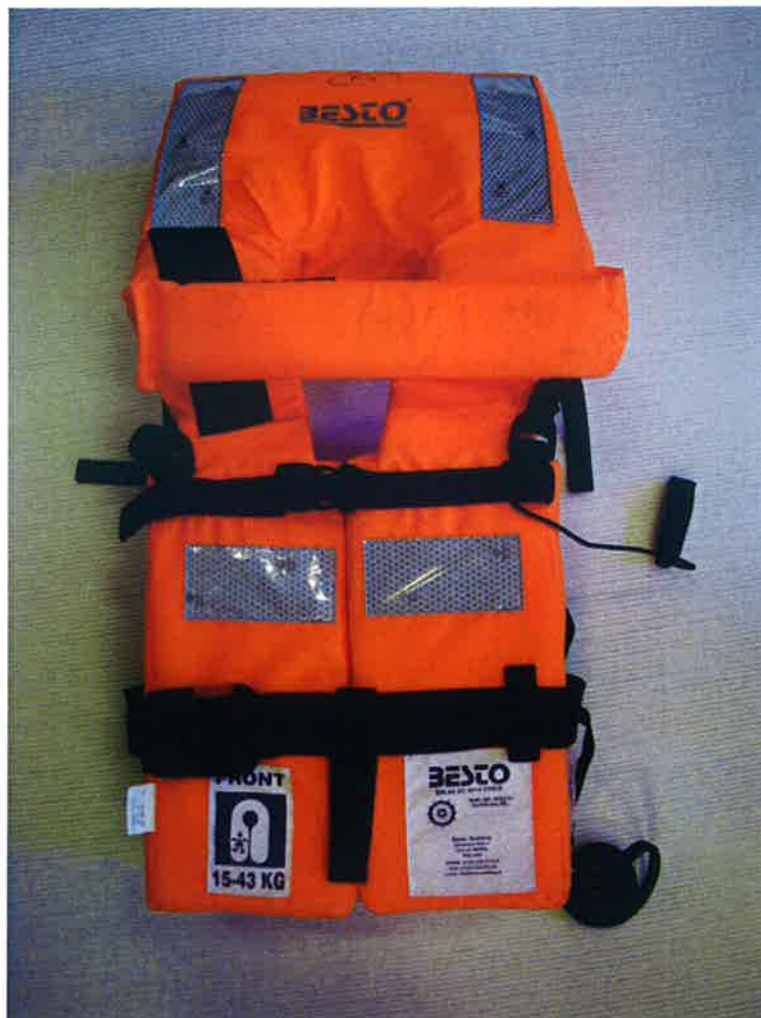
Model: SOLAS EC 2010 size Child